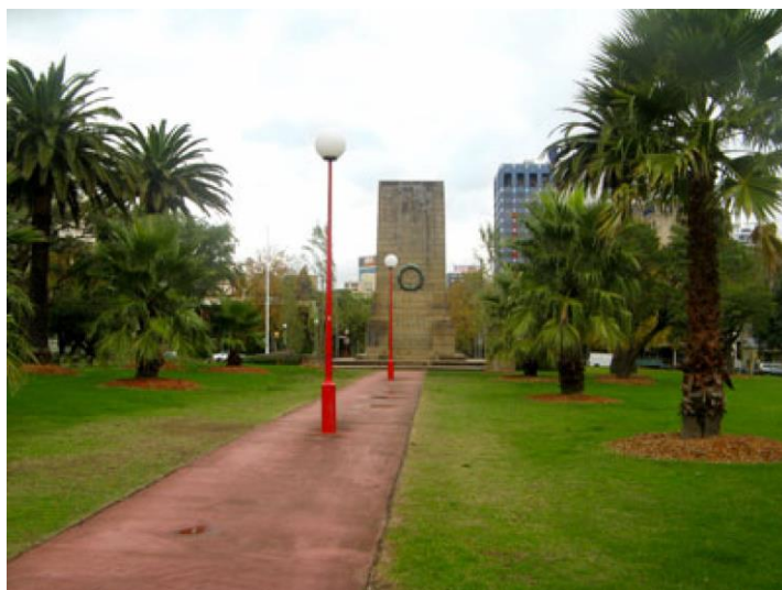
North Sydney War Memorial