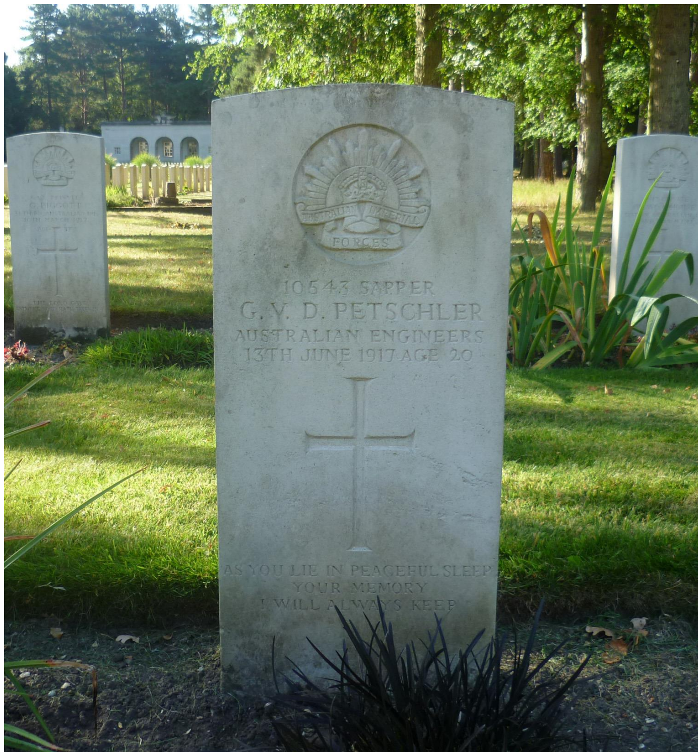
Photo of Sapper G. V. D. Petschler's Commonwealth War Graves Commission Headstone in Brookwood Military Cemetery, Surrey, England.